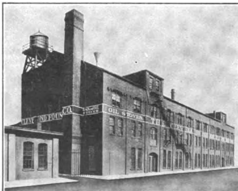
The Cleveland Foundry Company. Original Plant

devices manufactured up to that time. The new devices were named the Perfection Oil Heater and the New Perfection Oil Cook-Stove.