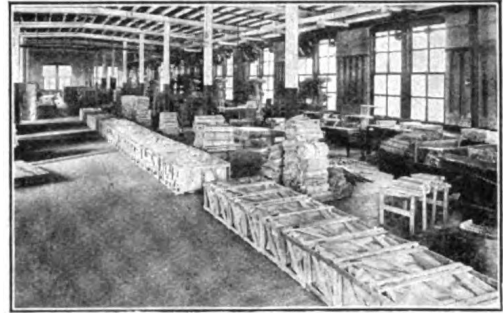
Shipping Department. The Cleveland Foundry Company

The Cleveland Foundry Company is almost a model of modern efficiency. Its plant and physical equipment are admirable. It employs only high-grade workmen, and trains them specially for the work they are to perform. From raw material to finished product, the work is carried on with the same care as in those first experimental days when Perfection stoves and heaters were being evolved. Quality has been the company's chief aim, and to maintain this quality it today employs a staff of sixty men who are engaged exclusively in the inspection of the heaters and stoves in all the stages of their manufacture, including an extensive final inspection of the finished product. Every stove is set up complete, lighted and tested, before it is crated for shipment.