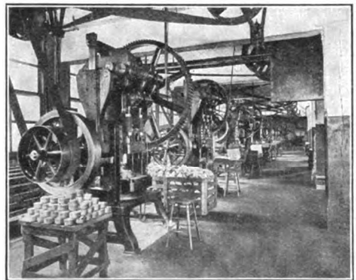
Drawing Presses. The Cleveland Foundry Company

They finally produced a stove and a heater which burned without smoke or smell, and which were in every way superior to other oil-burning