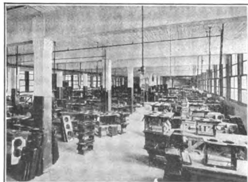
Assembling Department. The Cleveland Foundry Company Digitized by Google

It is interesting, however, to note the kinds and quantities of the raw materials which are used by the Cleveland Foundry Company in the course of a year,—the ingredients, or recipe as it were, for the world's enormous oil-stove order: 12,000 tons sheet steel, steel wire, hoops and bands; 32,000 base boxes tin plate; 2,000,000 pounds sheet brass, rod and tubing; 1,500,000 feet steel pipe; 20,000,000 stove bolts; 234,000 pounds solder, pig tin and lead; 140,000 pounds nails; 1,000 tons iron castings; 700,000 pounds acid; 32,000 pounds nickel anodes; 12,000 pounds mica; 750 barrels paint, varnish, lacquer and japan; 200,000 square feet glass; 4,800,000 wicks; 800,000 pounds paper; and 8,000,000 feet crating lumber.