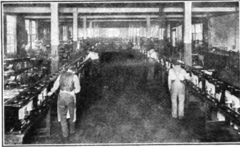
Testing and Inspecting New Perfection Oil Cook Stoves. Cleveland Foundry Company

The Cleveland Foundry Company is almost a model of modern efficiency. Its plant and physical equipment are admirable. It employs only high-grade workmen, and trains them specially for the work they are to perform. From raw material to finished product, the work is carried on with the same care as in those first experimental days when Perfection stoves and heaters were being evolved. Quality has been the company's chief aim, and to maintain this quality it today employs a staff of sixty men who are engaged exclusively in the inspection of the heaters and stoves in all the stages of their manufacture, including an extensive final inspection of the finished product. Every stove is set up complete, lighted and tested, before it is crated for shipment.