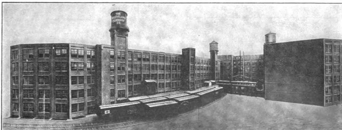
The Cleveland Foundry Company. Manufacturing Buildings, where Perfection Heaters and New Perfection Oil Cook Stoves are made