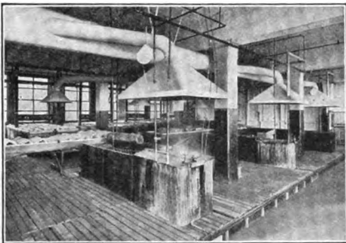
Plating Department. The Cleveland Foundry Company

Heaters marketed throughout the United States, but large quantities are exported to Canada, the West Indies, Mexico, South America, England, France, Italy, Turkey, Egypt, China, Australia and South Africa.