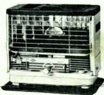
RADIANT 22 $159.95

Features sleek designer styling and a fuel tank that removes for easier filling. Burning time: over 20 hours. Pushbutton battery powered igniter built in. Automatic shutoff device for tip-over protection. Clear view fuel gauge. Both quick-action radiant and convection heat. Dimensions: 25 3/4" w x 12 1/2" d x 17 1/8" h. White baked enamel finish. Output: 9,400 BTU/hour.