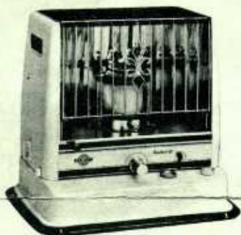
RADIANT 10 $229.95

The long-burning champion of the Kero-Sun line. Burns over 30 hours on less than two gallons of fuel. Pushbutton built-in battery powered igniter. Protected in event of tip-over by automatic shutoff. White baked-enamel finish. Clear view fuel gauge. Compact and fully portable. Dimensions: 21" w x 15 1/4" d x 19" h. Radiant and convection heat. Output: 9,400 BTU/hour.