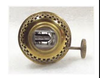
Bottom view. See the gearing is touching the side draft tube.

The No. 1 Plume & Atwood Victor burner appears to be a pure Kosmos 6" burner for the fit of the chimney and the wick.