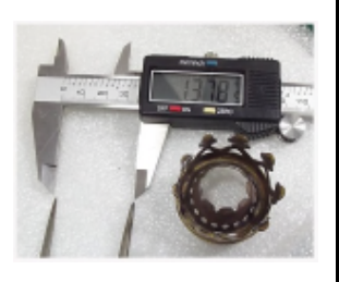
The gallery measured 1.378". There was easily enough room for a 6" chimney.